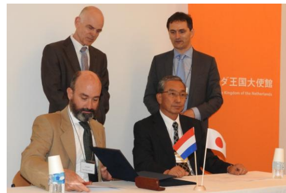
MOU signing ceremony, June 23, the Netherlands Embassy in Tokyo

For example, in June 2016 a MOU on Turbomachinery between the Delft University of Technology (TU Delft) and the Osaka Institute of Technology (OIT) was signed. Both universities will collaborate in the field of Turbomachinery for aerospace and industrial applications, an area of vital importance to solve the future challenges in this field. As first activity under the MOU, both universities will exchange students and researchers from coming August.